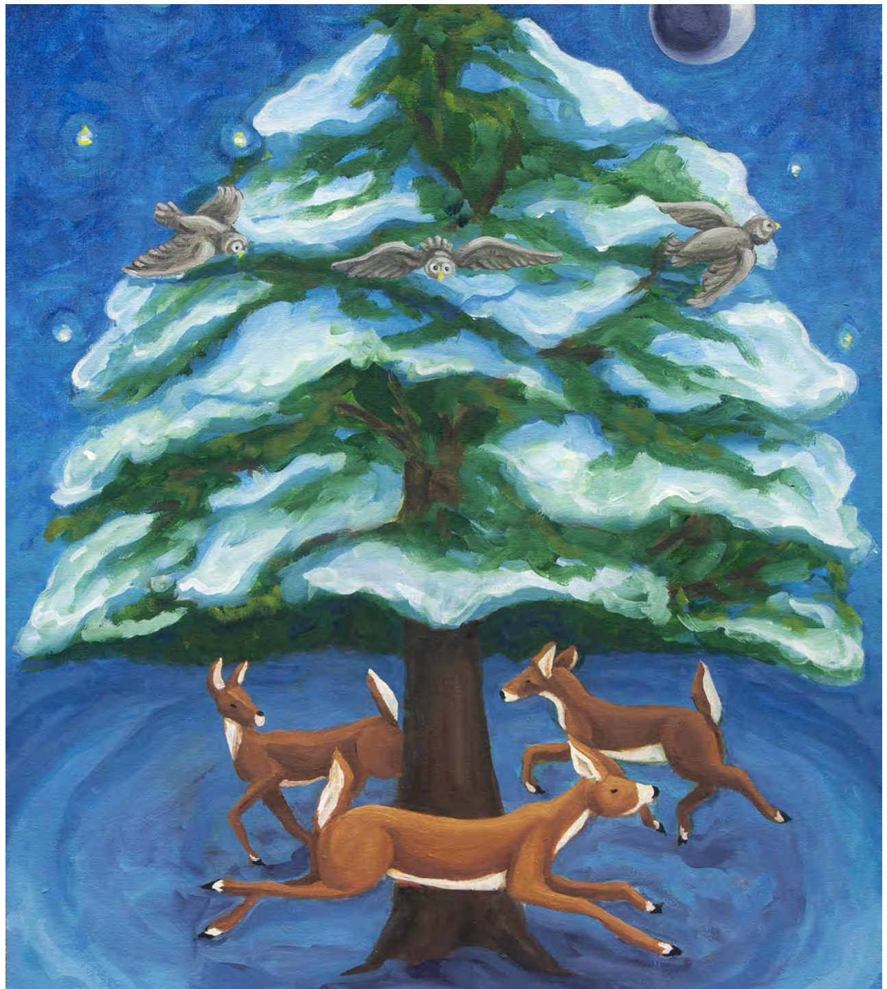
WINTER DEER 2024 oil on linen 32 x 24 inches