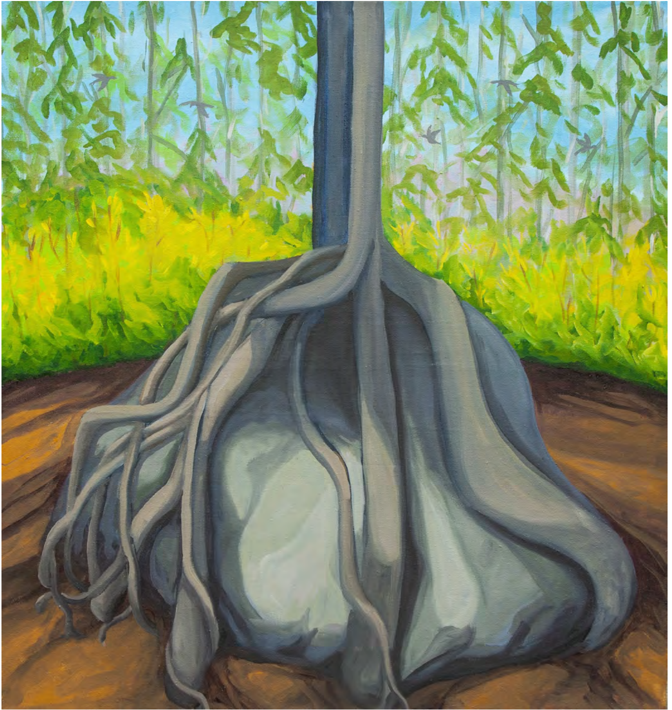
BAXTER, TREE OVER ROCK 2024 oil on linen 34 x 32 inches