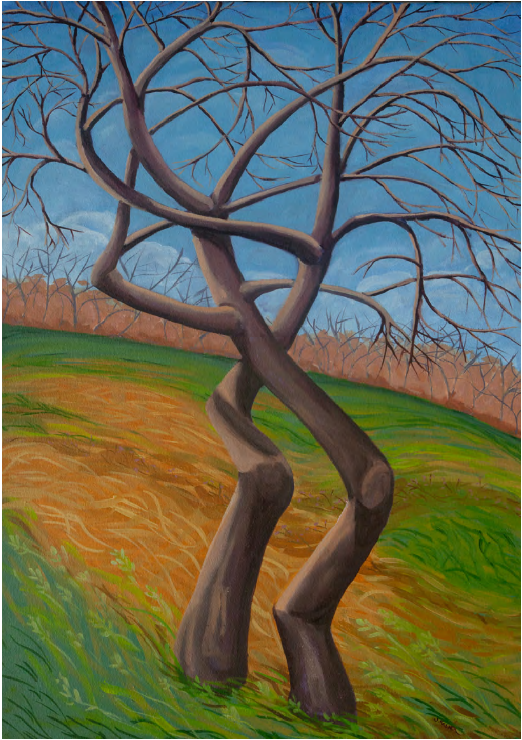
DANCERS, OLD COUNTY ROAD 2024 oil on canvas 36 x 26 inches