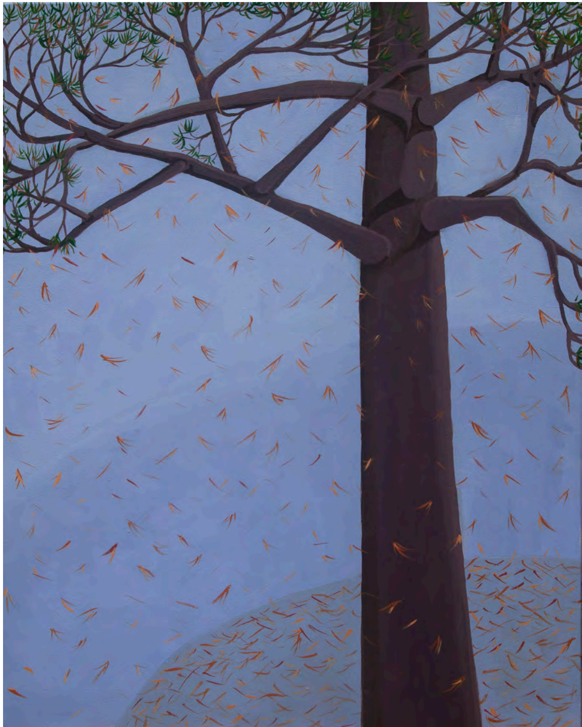
PINE NEEDLES 2024 oil on canvas 30 x 24 inches