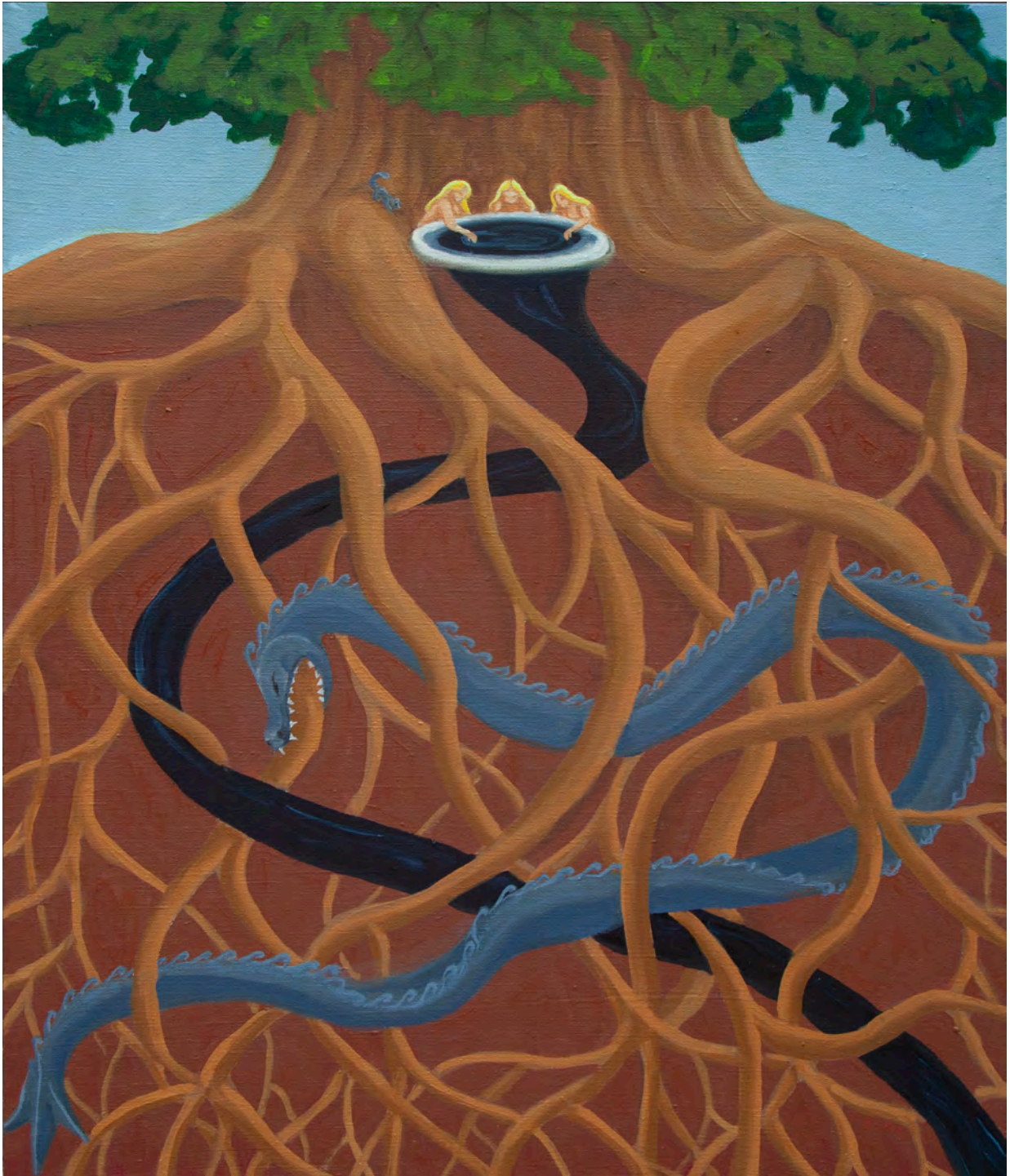
THE ASH, Yggdrasil 2024 oil on linen 28 x 24 inches