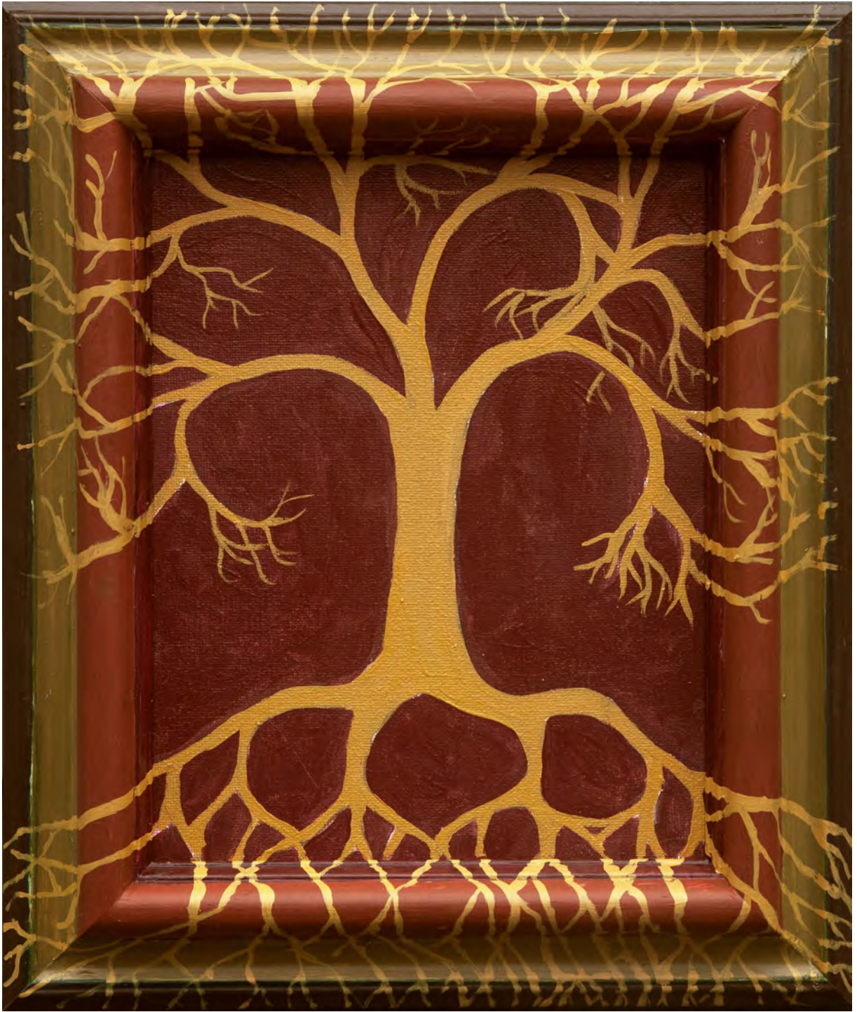
TREE 2023 oil on canvas and wood 13 1/2 x 11 1/2 inches