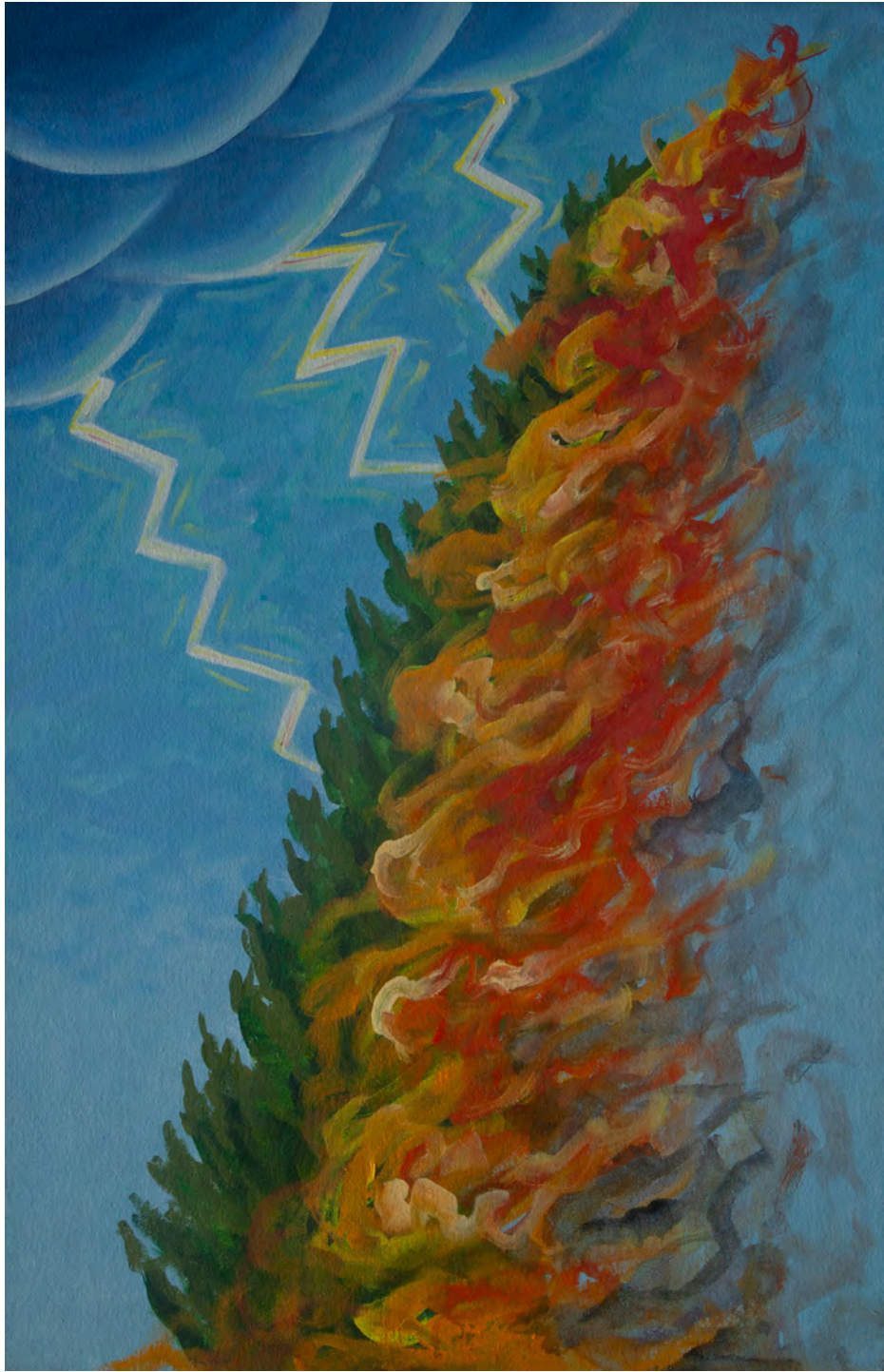
FIRE 2024 oil on canvas 25 x 18 inches