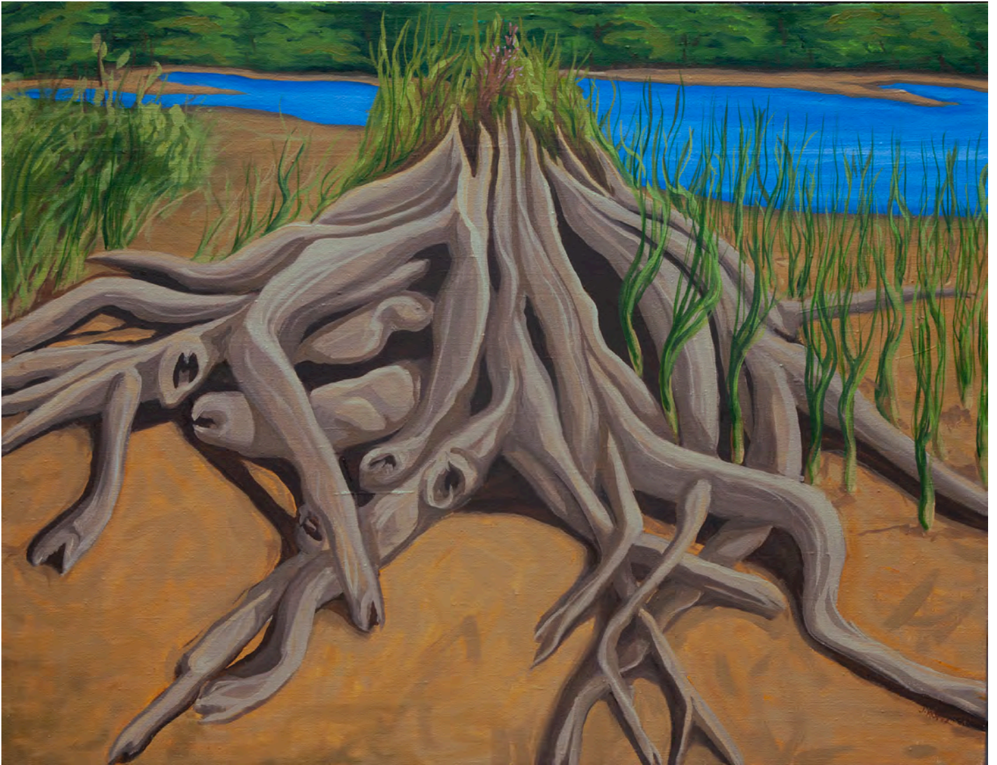
LOW WATER, MATAGAMON 2024 oil on linen 26 x 34 inches