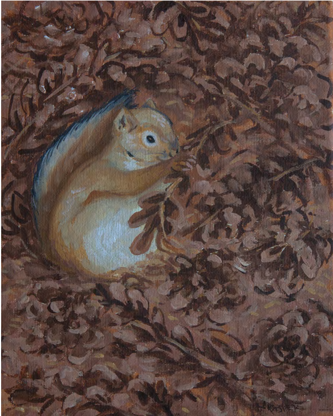
FEAST 2024 oil on canvas 10 x 8 inches