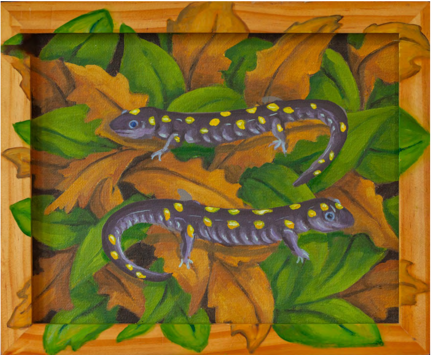
COMING AND GOING 2023 oil on canvas and wood 9 3/4 x 9 3/4 inches