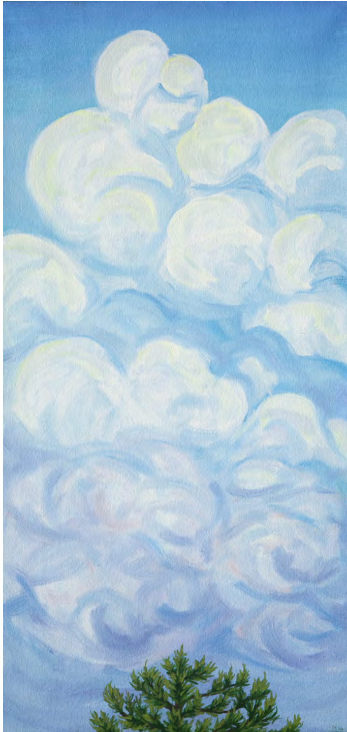
PINE TOP 2024 Oil on canvas 24 x 12 inches