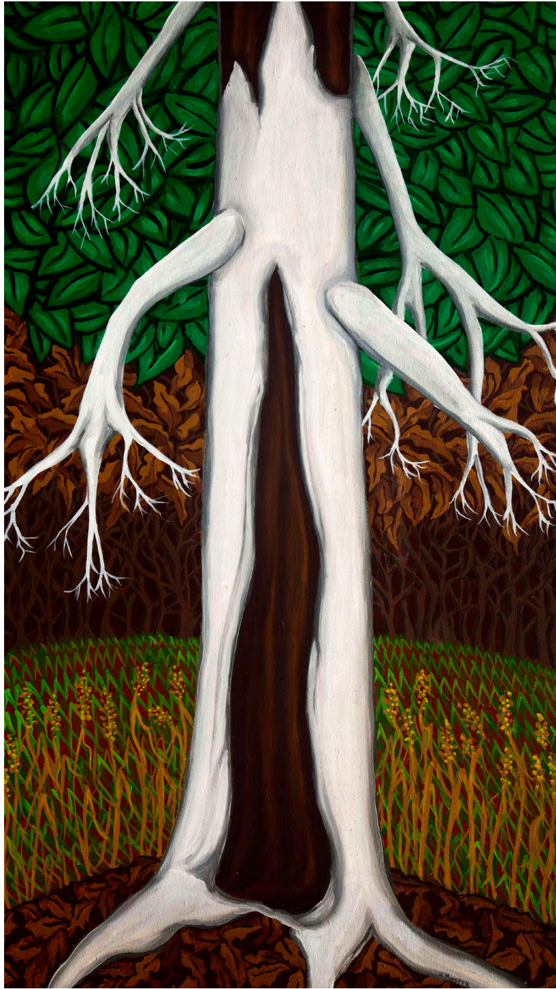
DEAD TREE 2023 oil on linen 46 x 26 inches