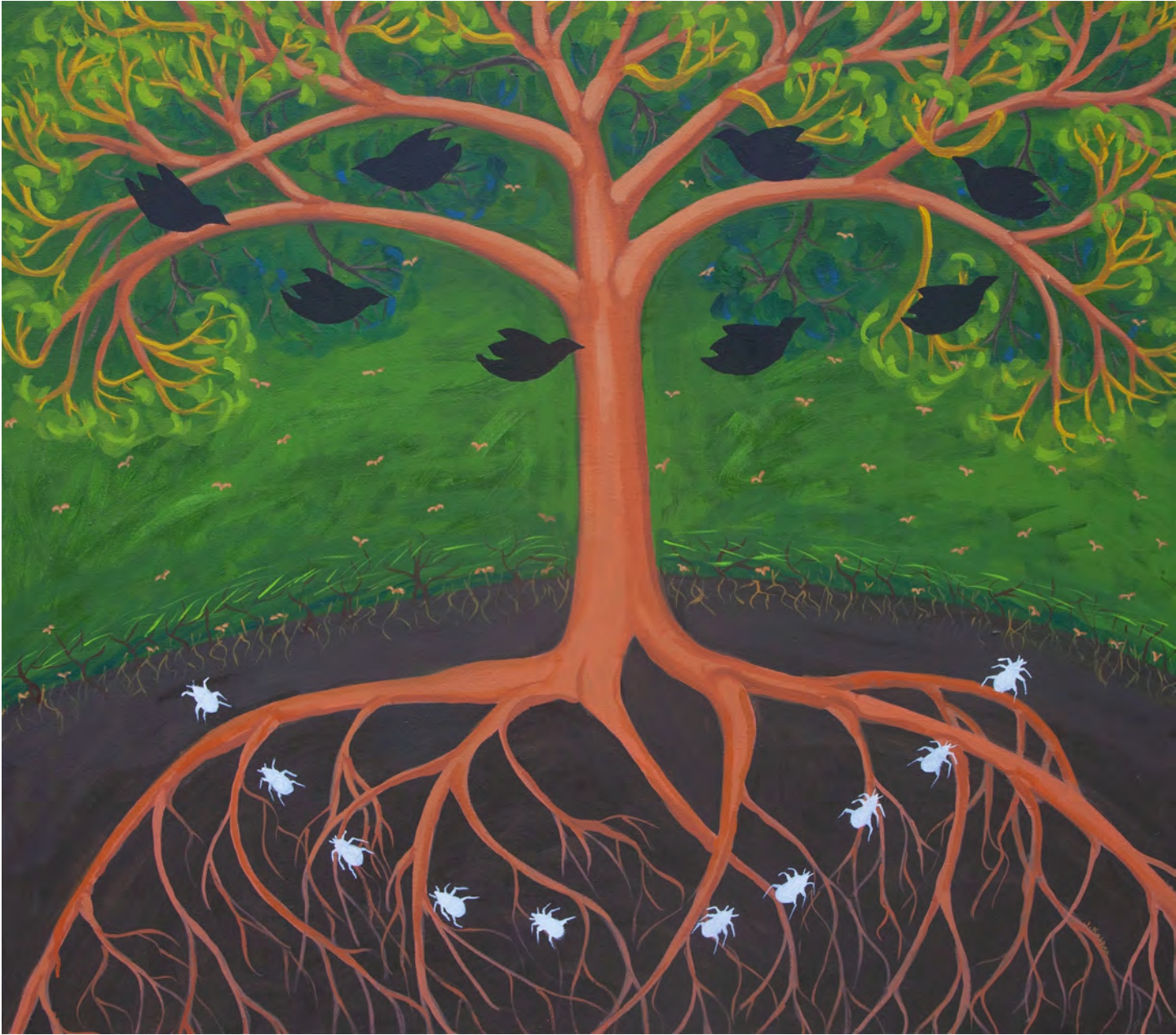
ABOVE AND BELOW 2024 oil on linen 34 x 38 inches