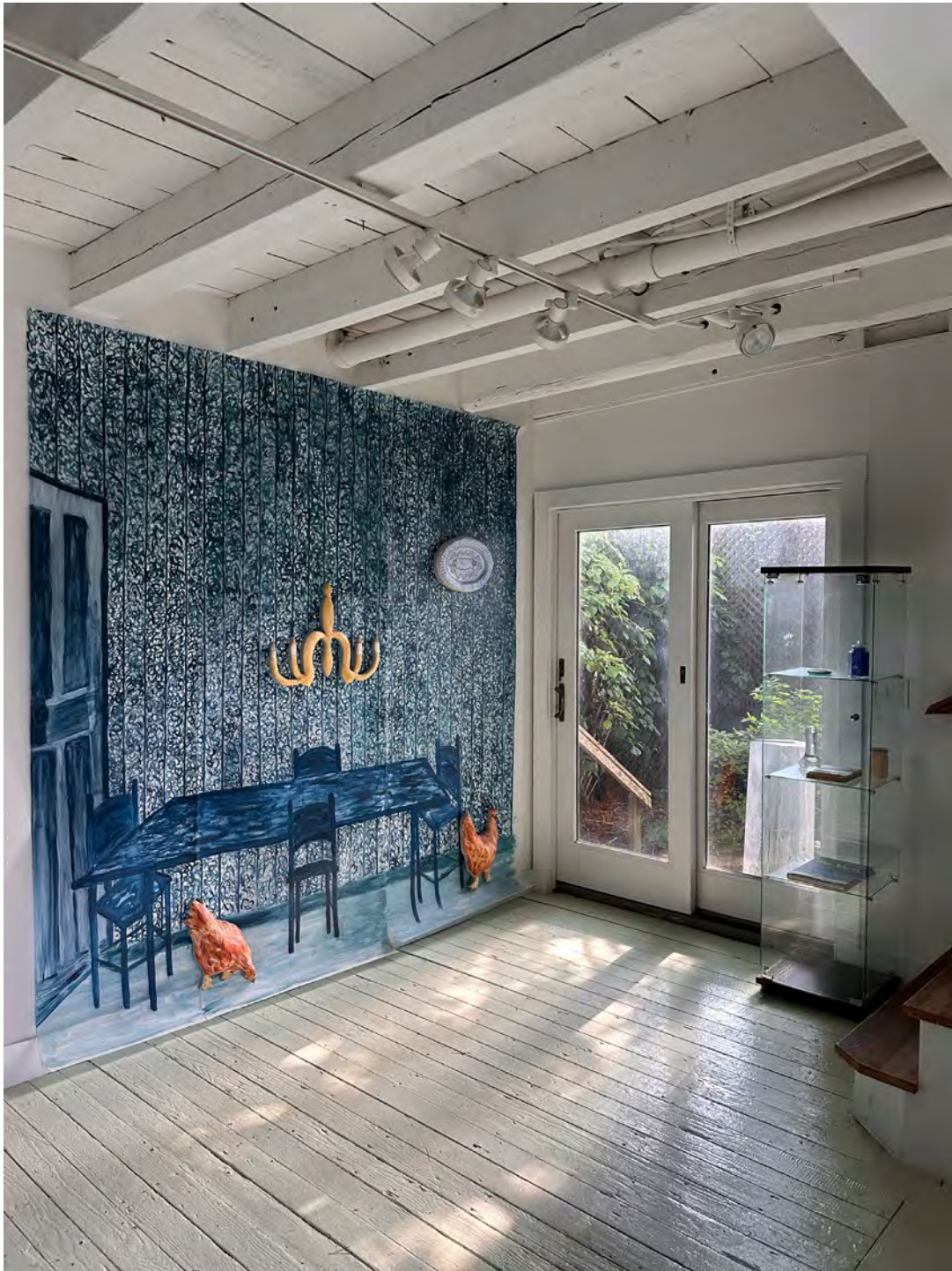
WHEN CHICKENS COME INSIDE 2024 Acrylic painting on Mylar with frescoes attached