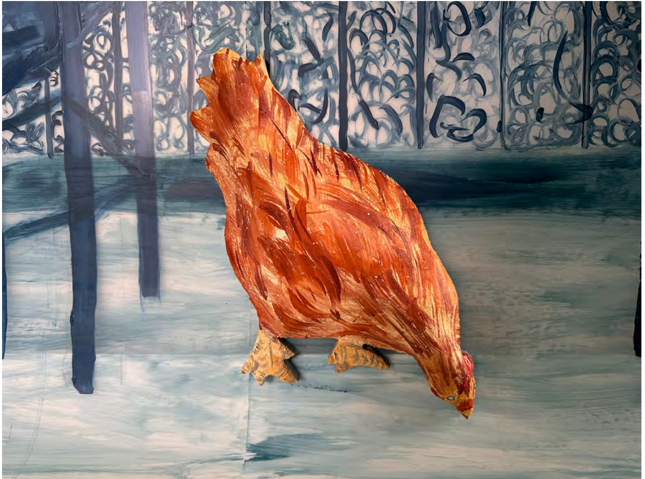
BUFF ORPINGTON HEN (Pecking) 2024 shaped fresco 17 x 9 1/2 x 4 inches