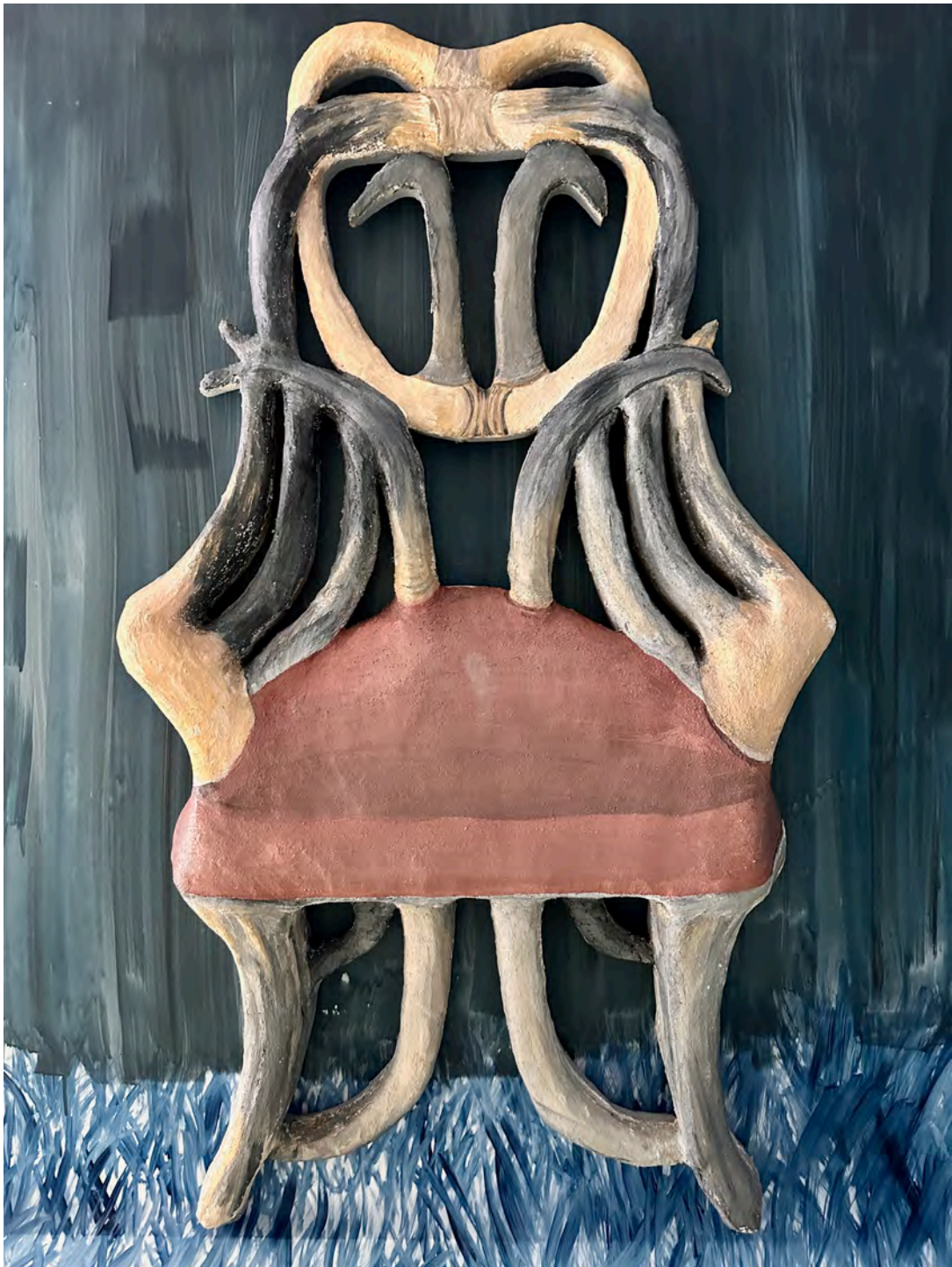
HORN CHAIR FRONT VIEW 2024 shaped fresco 37 1/2 x 22 x 4 inches