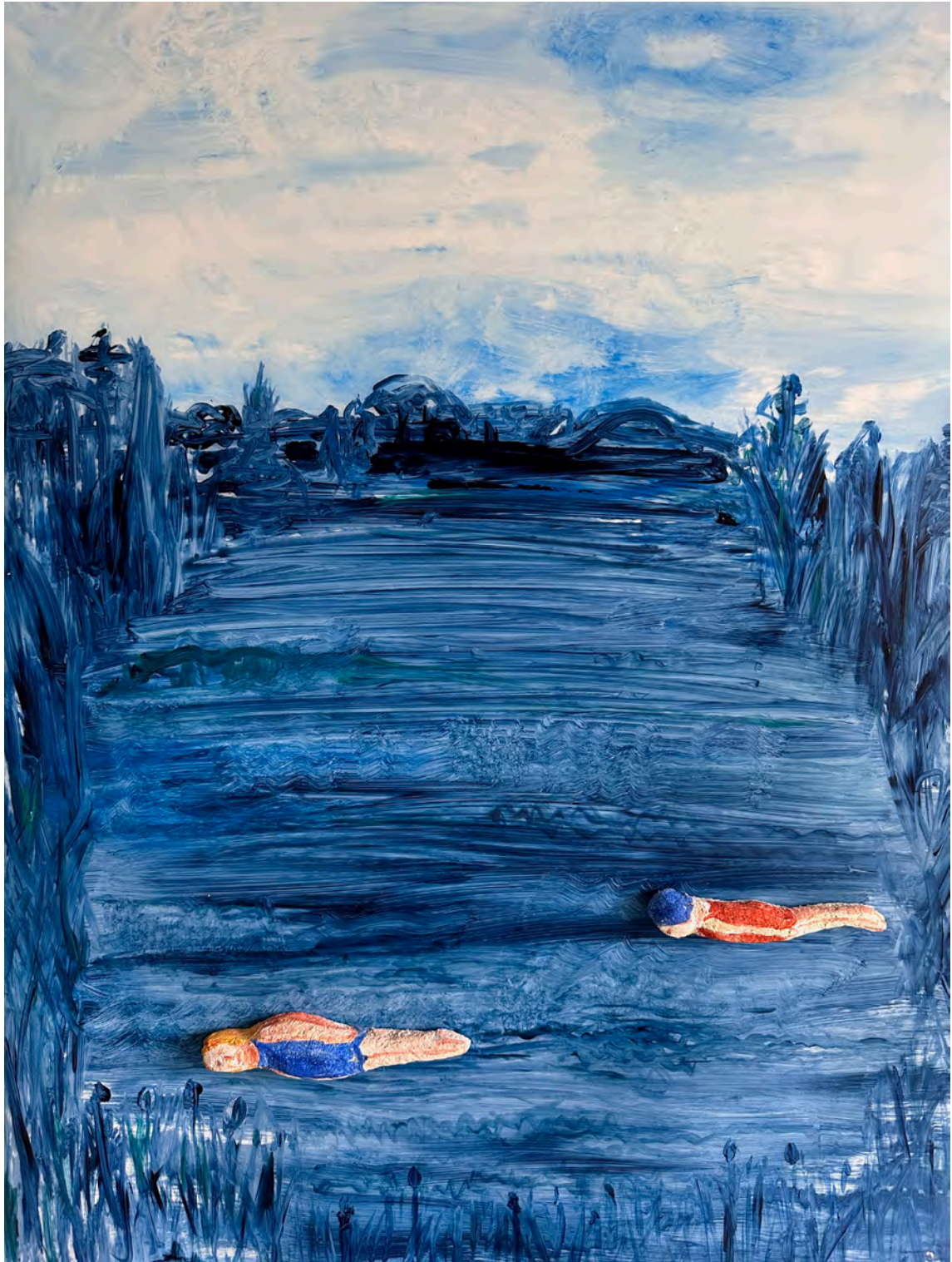
LAKE WITH SWIMMERS 2024 Mylar drawing with shaped frescoes 30 x 22 inches