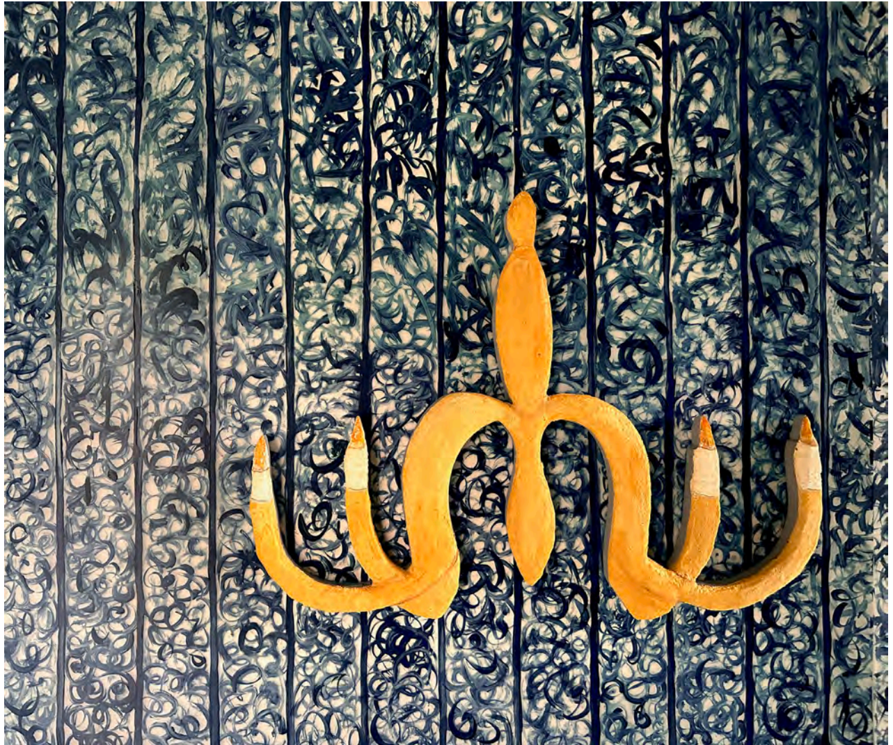
CANDELABRA 2024 shaped fresco 17 x 21 1/2 x 5 inches