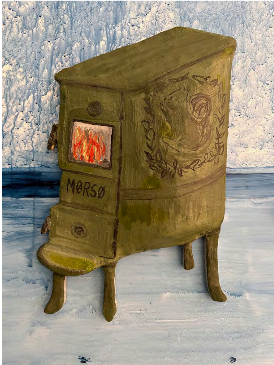
MORSO STOVE 2024 shaped fresco 22 x 14 1/2 x 4 inches