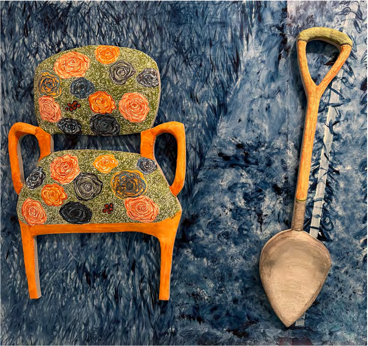
MILWAUKEE CHAIR 2024 shaped fresco 35 x 22 x 4 inches