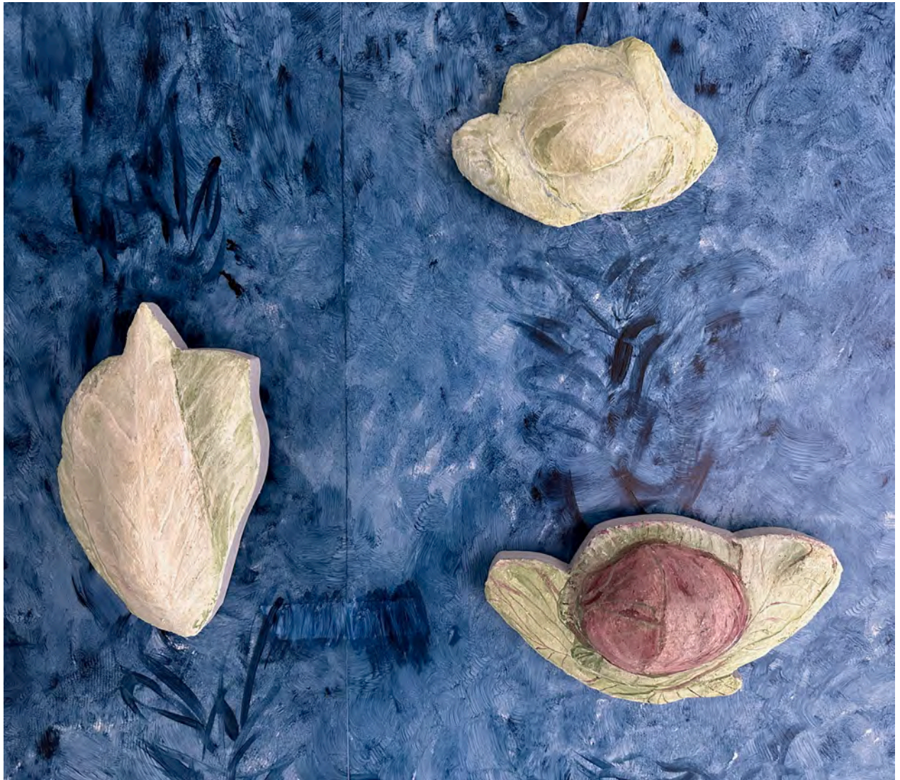
CARAFLEX, GREEN AND RED CABBAGES 2024 shaped frescoes