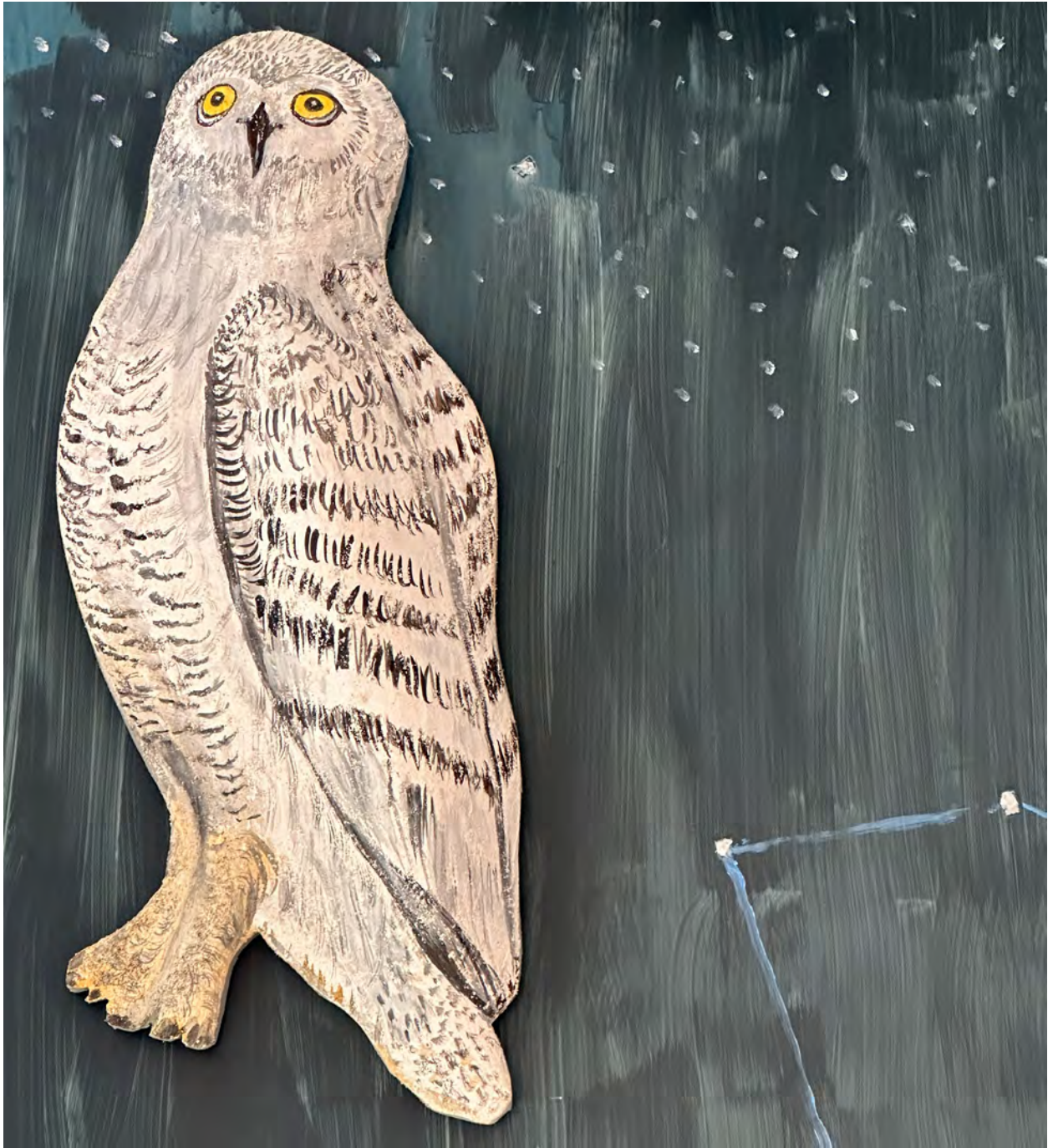
SNOWY OWL 2024 shaped fresco 22 x 9 1/2 x 4 inches