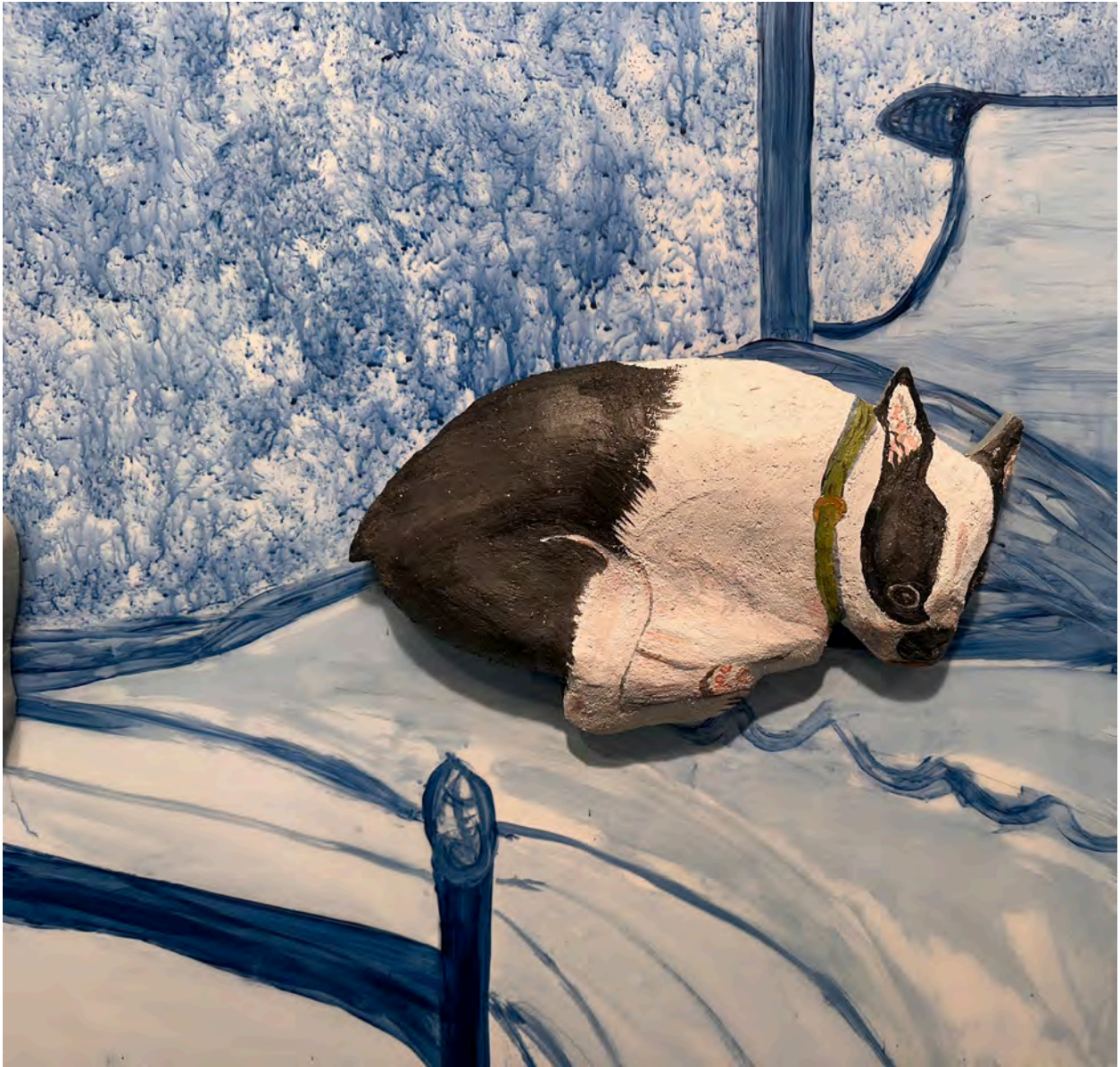
CURLED BOSTON TERRIER 2024 shaped fresco 13 x 7 x 4 inches