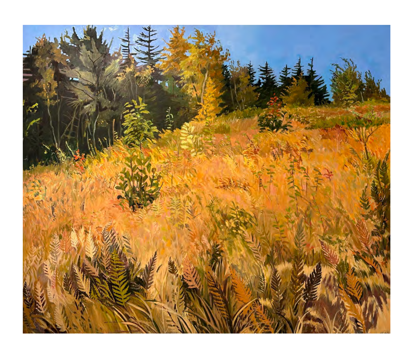
FIELD 1994 oil on canvas 50 x 60 inches